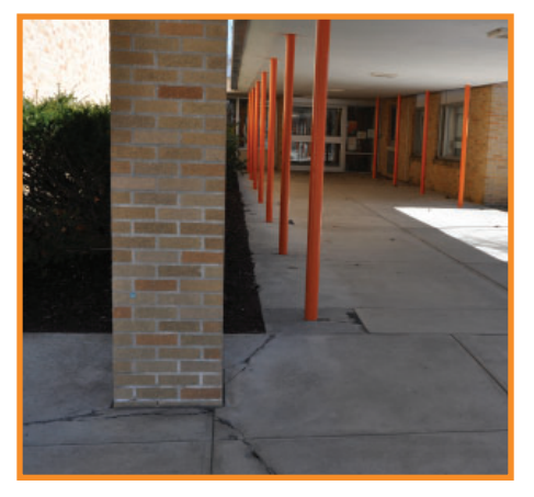
Oak Street's old canopy will be replaced as part of the capital project.